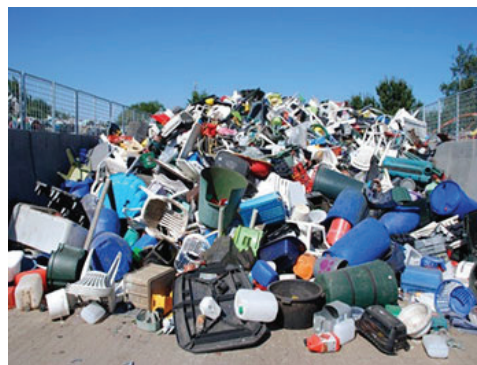
Material before baling