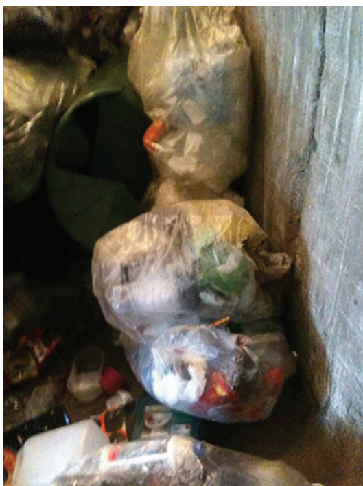
Material before baling